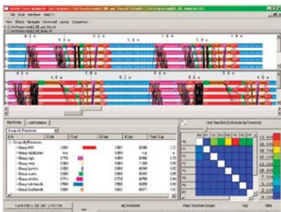
New comparison displays for comparing two trace files